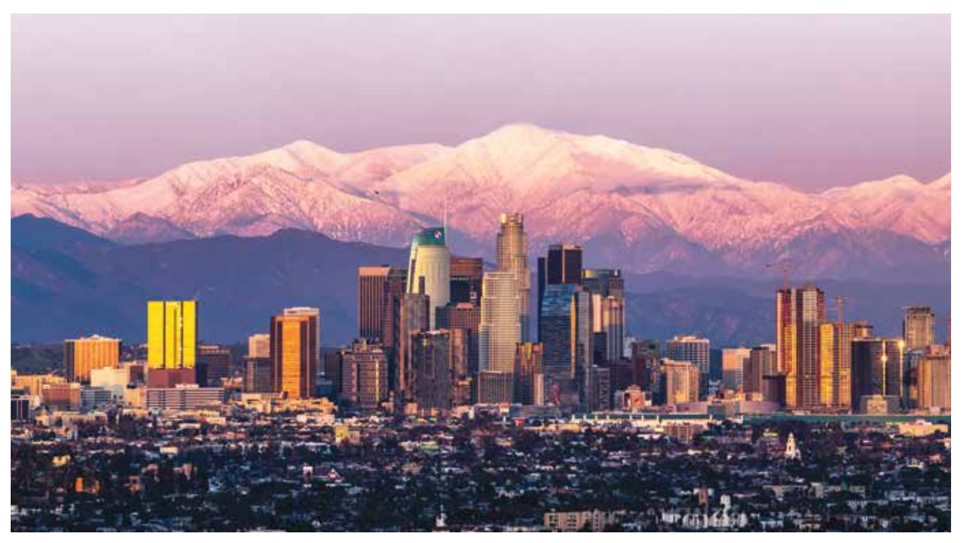
Downtown Los Angeles sits against the backdrop of Mount Baldy. This year, the city is playing host to the AAE, taking place through Saturday.