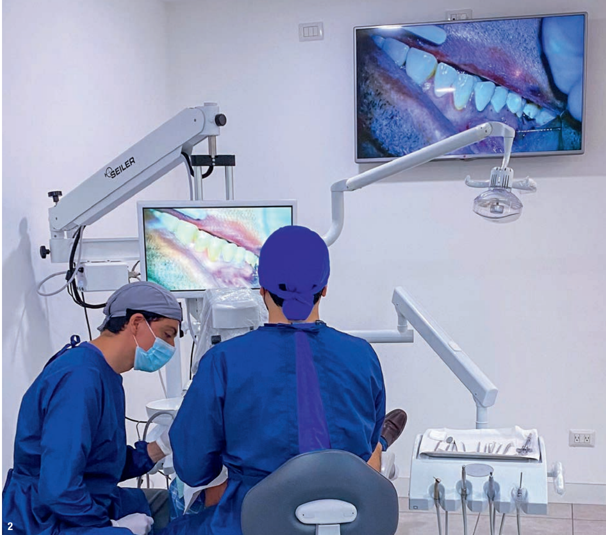
Fig. 2: The PromiseVision 3D surgical microscope being used during an apical microsurgery procedure.

final-year students and lecturers at the dental school of the Universidad Mariano Gálvez de Guatemala in Guatemala City. Each participant performed three manual tests of precision and dexterity divided into three stages as follows: unaided vision, using an Alpha Air 6 operating microscope (Seiler Instrument; Fig. 1) set to 8× magnification and using a PromiseVision 3D microscope (Seiler Instrument; Fig. 2) set to 8× magnification.