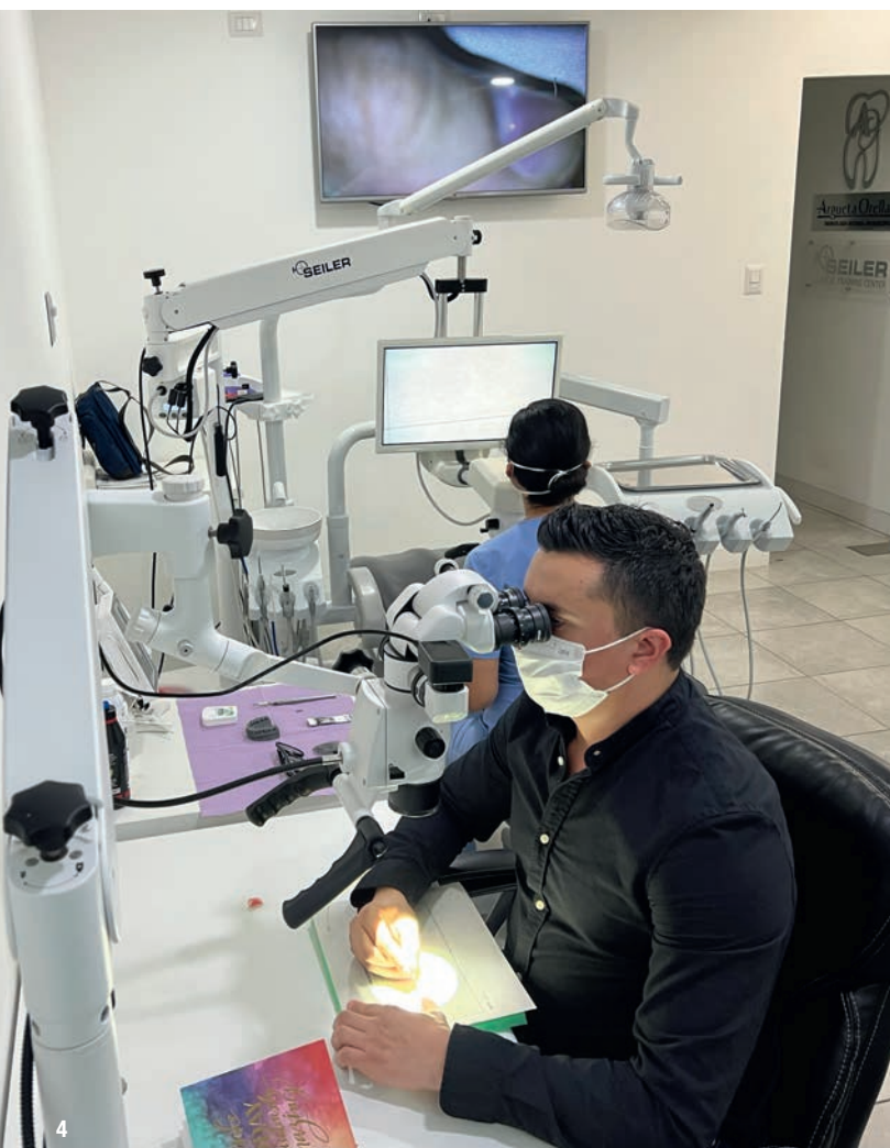
Fig. 4: The study participants working on the fine motor skill tests.

It is necessary to understand the importance of magnification to achieve quality results in dental procedures and to reduce the margin of error, and the use of magnification in turn requires fine motor skills in dentistry. That is why this study aimed to evaluate and compare fine motor skills without the use of magnification, with the use of a conventional microscope and with the use