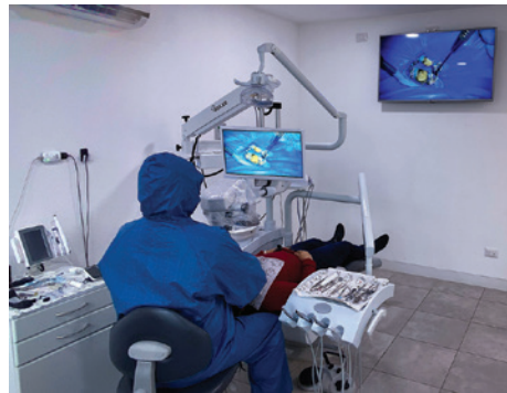
Fig. 3. Heads upright working position using the Promise Vision Surgical Microscope, as the microscope does not have binoculars, the clinician can have full sense of the clinical environment by aid of peripheral vision.

The novel Coronavirus disease is defining new risks for all dental practitioners. Some of the common transmission ways of COVID-19 are contaminated droplets in the air by eye, nose and mouth exposure (14). As healthcare