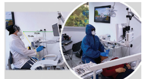
Fig. 4. Ergonomically working positions, long working distance and use of personal protective equipment without interfering with the clinical working posture and use of the Promise Vision 3D Surgical microscope are shown in this picture.

The 3D dental microscope, a relatively recent introduction into modern dental therapy, with complementary accessories (such as variofocus, recording system, motorized positioning of the high definition screen, 3 axis motion of the optical head, etc.) allows new possibilities to the ergonomic imperatives of the dental profession. The ideal working posture can be attained with a combination of the dentist/patient position and the capability of placing the microscope in ideal angulation for every treatment without affecting the most ergonomic posture of the practitioner (Fig 4)