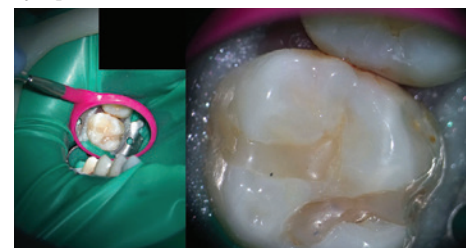
Fig. 2. Picture on the left was taken with the lowest magnification offered by the Seiler Promise Vision Surgical Microscope, while the picture on the right shows the same image at highest magnification, more small details are visible at higher magnifications, nevertheless the depth of field will decrease.

The American Dental Association adopted the use of the microscope as a requirement in the graduate endodontic programs and with time the microscope has become more user friendly. As a result, we are witnessing more acceptance in almost all areas of dentistry. For example, the diagnostic analysis of patient symptoms can more detailed. Fractures or